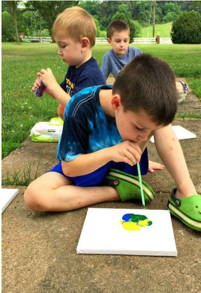
Paddlepop stick art